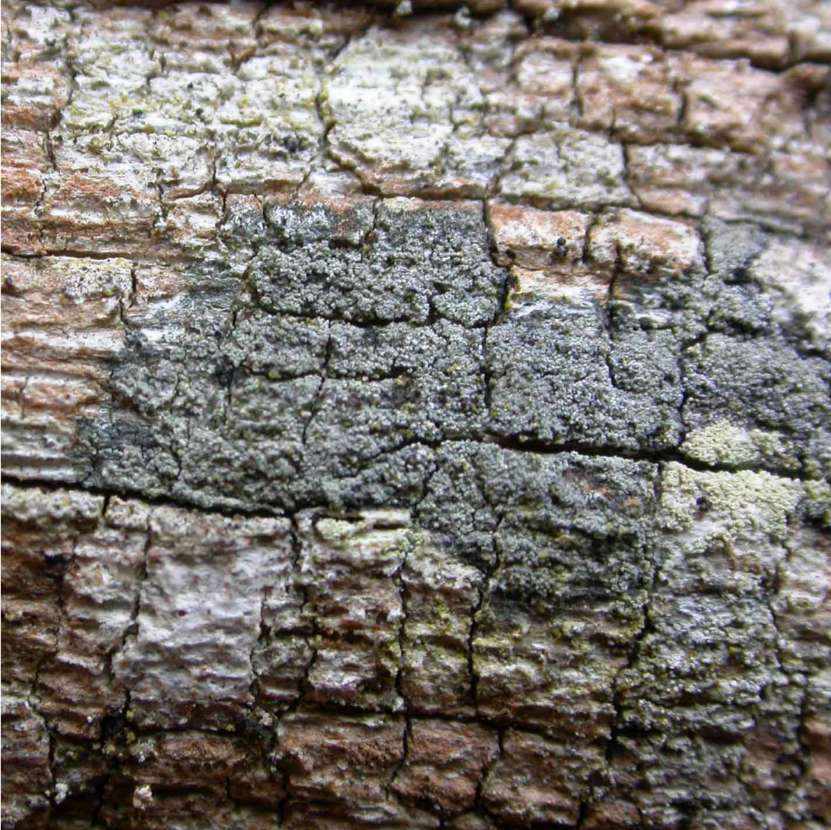
Lecidea nylanderi growing on the exposed wood (lignum) of a veteran tree in Oxfordshire. Note the grey granular crust (with a hint of slate blue) and the black staining of the wood beneath and around the granules.