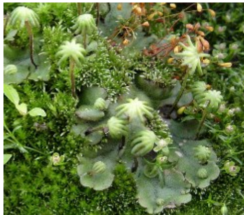
Marchantia polymorpha, showing archegoniophores

Although A. muscivora is known to colonise several bryophyte species, we are not aware of any reports from Marchantia , so it will be very interesting to see if this is indeed a novel species when we sequence it. Either way, this is a new genus and species to the UK, and may well be much more common than the single UK record suggests. We'd be very interested in any other finds of this species.