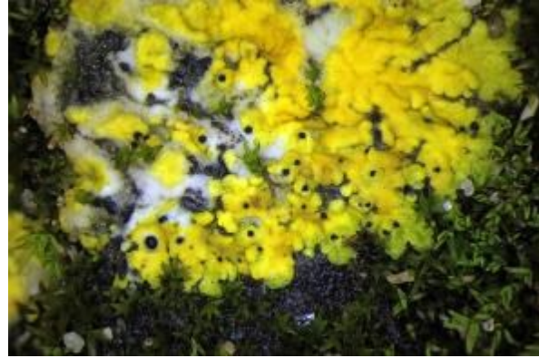
Favolaschia calocera at Halwyn, W Cornwall (left), Lichenochora epifulgens (black perithecia on the lichen thallus), right.